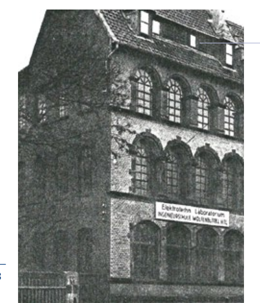
Laboratory building of the former engineering academy in Wolfenbüttel

Increasing student numbers led the University of Applied Sciences to open additional sites: It has been represented in Wolfsburg since 1988, in Salzgitter since 1993, and in Suderburg since 2009. In the fall of 2010, the Faculty of Social Work left its Braunschweig site and moved to larger premises on the "Am Exer" campus in Wolfenbüttel.